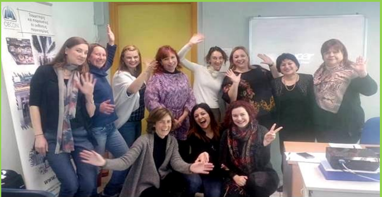
EFEB partners at the Kick-off Meeting

The EFEB project started in October 2015 and will last for 2 years. This first newsletter reports on the initial progress made.